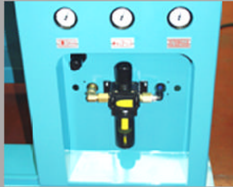
PNEUMATIC CONTROL PANEL